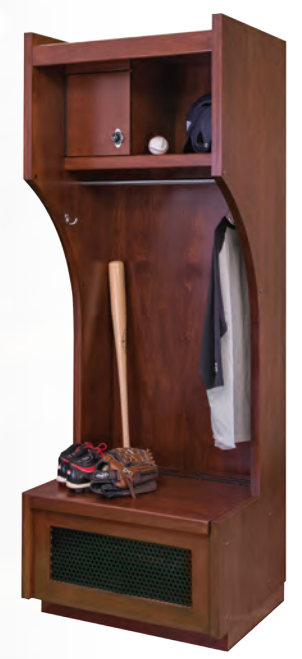
Half Curve Sides