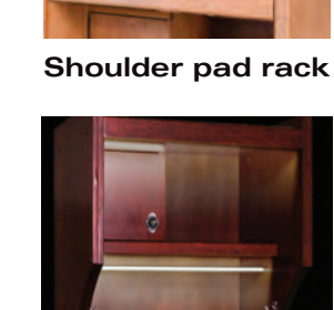
LED lighting kit