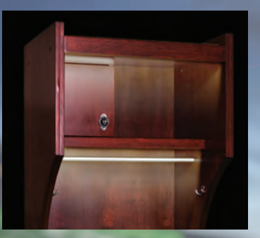
Optional LED Lighting under locker top and/or under shelf

Equip them with the industry's finest all-wood sport lockers. Superior® Recruiter™ custom wood sport lockers are made to order, and offer a variety of different options allowing you to tailor your locker room to your team's specific requirements.